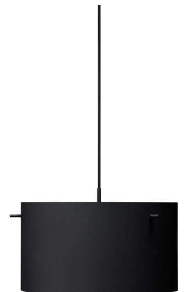
\varnothing 41 cm: matt black: art.no. 109302 \varnothing 41 cm: matt white: art.no. 109304