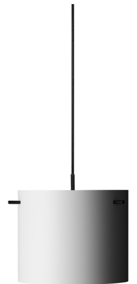
\varnothing 28 cm: matt black: art.no. 109310 \varnothing 28 cm: matt white: art.no. 109312