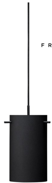
\varnothing 16 cm: matt black: art.no. 109318 \varnothing 16 cm: matt white: art.no. 109320